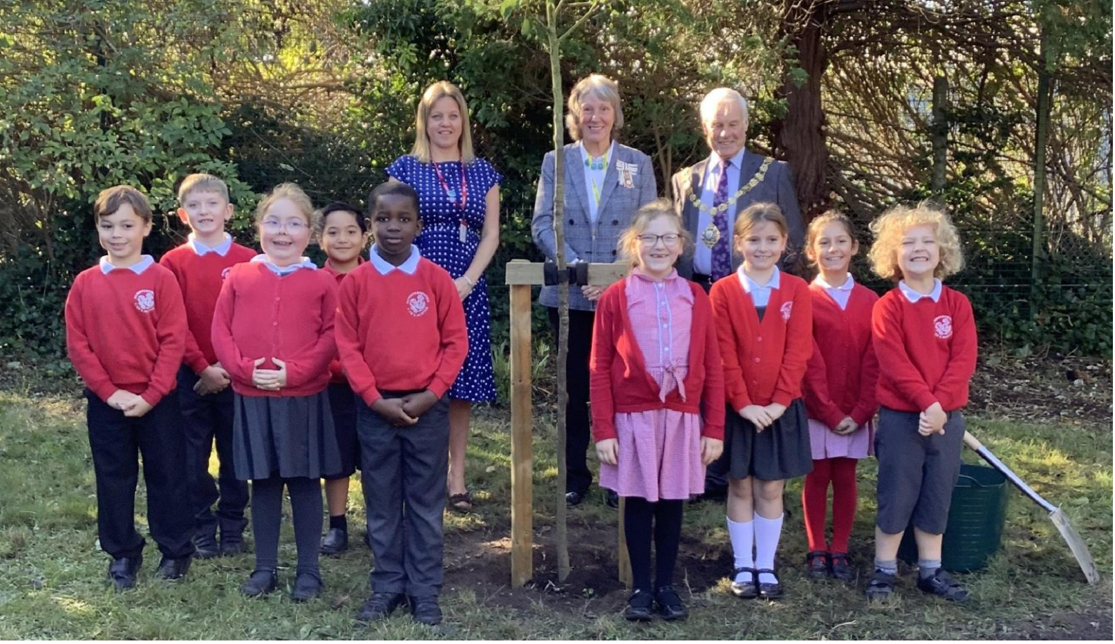
Thank you for your interest in the post of fixed term Pastoral Support Teaching Assistant at Rumboldswhyke Church of England Primary School.

This would be an ideal opportunity for a person looking to gain greater pastoral experience working with students of a primary school age. This is ideally a full-time post, although part time employment would be considered for the right candidate. The role would consist of working in both our nurture room and within classrooms to support pupils to flourish and achieve their potential. This is a key post which is centred around providing a secure and calm classroom base and supporting children to understand and regulate their own emotions whilst also respecting the feelings of those around them.